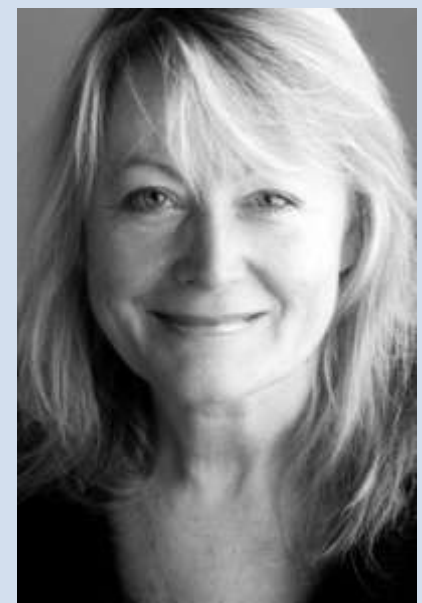
author photo © Katie Vandyck

Novel ISBN: 978-1-905614-71-4 198 x 129 mm £8.99 pbk 176pp November 2009